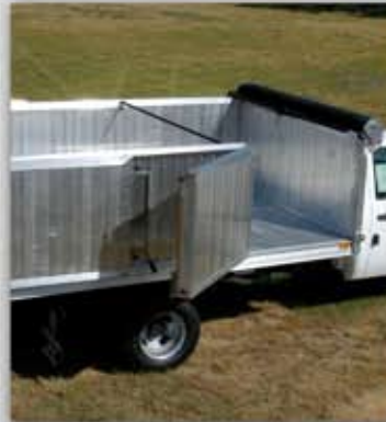
ITB truck bodies use our rugged Snaplock construction to provide superior strength and appearance.

Intercontinental Truck Body (ITB) is proud to be the finest specialty body and equipment company in the world. ITB has been manufacturing the most practical, reliable equipment since 1979. We are proud to build our products in Conrad, Montana.