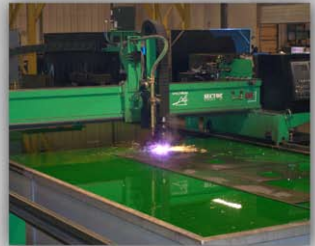
ITB's continuous investment in equipment allows for engineering & implementation of new product lines.

In addition to the bodies that we manufacture, ITB is also a distributor for well-known brands such as Knapheide, Texoma, Waltco, Adrian, Tommygate, Pro-Tech, Maxon, Anthony, Carrier, Thermo King, Hehr and many others; each provide further opportunities to fit our customers' needs.